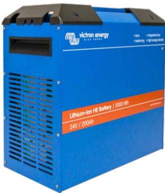
24V/200Ah HE battery