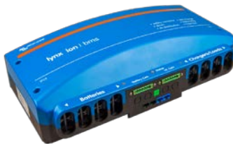
Lynx-ion BMS 1000A